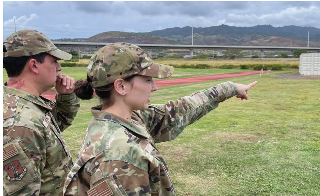
Service Members support training in the field during the FY22 Special Olympics of Hawai'i Mission.

The fiscal year (FY) 2023 Innovative Readiness Training (IRT) mission planning season is in full swing. The military departments are on track to perform 44 civil-military partnerships and train 6,769 Service Members across 28 U.S. states and territories. These missions encompass 19 civil engineering projects, 16 medical missions, three transportation activities, two cybersecurity missions, two aerial spray missions, one emergency management planning operation, and one civil affairs community needs assessment. Additional non-Office of the Secretary of Defense-funded mission opportunities will build on this impressive portfolio as the year progresses.